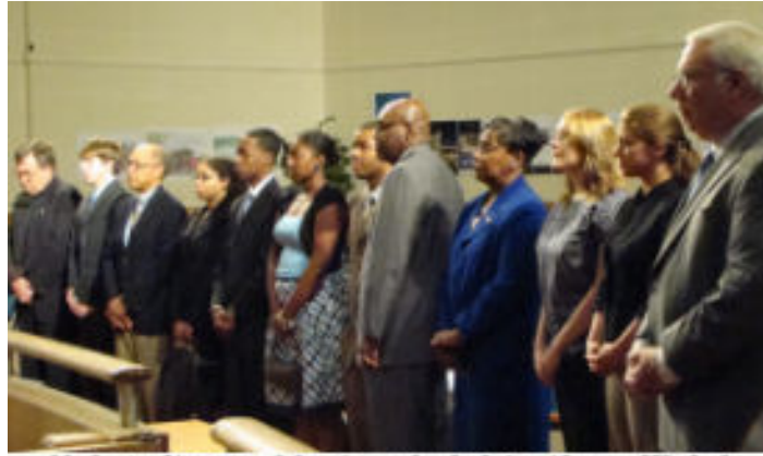
University presidents, administration officials and students from local universities honored in the Council Chamber

The Council honored in a proclamation presentation the graduating classes of 2009 from seven local universities: Tulane, Dillard, Xavier, UNO, SUNO, Our Lady of Holy Cross, and Loyola.