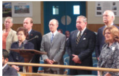
Members of the Consular Corps of New Orleans

The Council, as its first Order of Business, honored the Consular Corps of New Orleans for their continued commitment to the City of New Orleans.