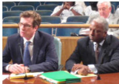
Representatives from Orleans Public Defenders Office

Representatives from the Orleans Public Defenders (OPD) Office came before the Council today to give a report on the Office's mission, operational status and funding.