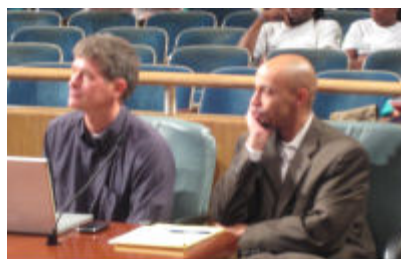
Prospect One Representatives