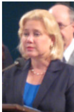
U.S. Senator Mary Landrieu

Senator Mary Landrieu came before the Council today to distribute to Councilmembers a report on the state of Louisiana's recovery progress.