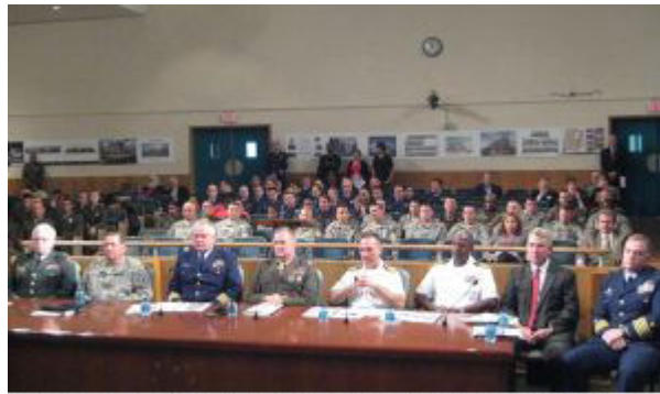
Mayor's Military Advisory Committee Members and Military Leaders

The Mayor's Military Advisory Committee came before the Council today to conduct the annual Military Appreciation Day activities including the Committee's annual report, performances by