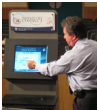
Public Information Kiosk Demonstration