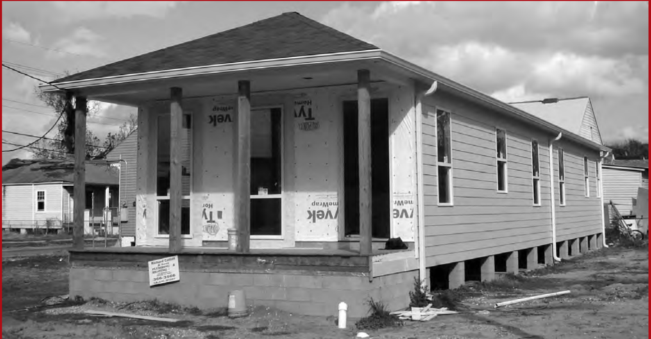
Jericho Road Episcopal Housing Initiative