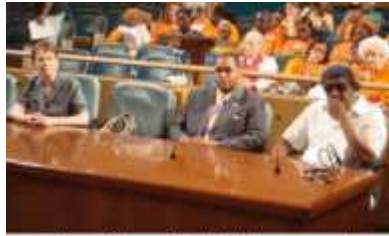
New Orleans Public Library and NORD Representatives