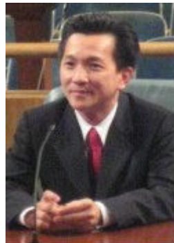
Congressman-Elect Anh "Joseph" Cao

Congressman-Elect Anh "Joseph" Cao came before the Council today to introduce himself and receive the congratulations of the Council on his recent election.