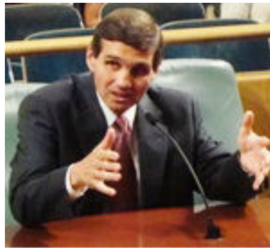
District Attorney Leon Cannizzaro

District Attorney (DA) Leon Cannizzaro appeared before the Council to request that the Council pass an Ordinance allowing for the transfer of simple possession of marijuana cases from Criminal District Court to Municipal Court. Cannizzaro also requested that the Ordinance allow police officers to issue a ticket to, rather than make an arrest of, individuals charged with simple possession of marijuana.