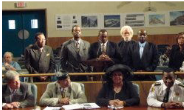
Greater New Orleans Gun Buy Back Committee Members and NOPD Chief Riley

Members of the Greater New Orleans Gun Buy Back Committee, along with New Orleans Police Department (NOPD) Chief Warren Riley, came before the Council today to discuss the details of this year's Gun Buy Back program.