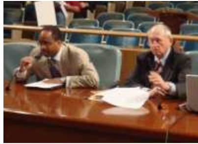
New Orleans Aviation Board Representatives

The Council passed Resolution R-08-153 authorizing the New Orleans Aviation Board to undertake construction of a consolidated rental car facility. Since Hurricane Katrina, during peak demand periods, there are fewer rental cars available than