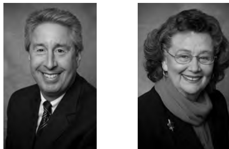
(L-R) Council President and Councilmember-at-Large Arnie Fielkow and Council Vice-President and Councilmember-at-Large Jacquelyn Brechtel Clarkson

The New Orleans City Council is the legislative branch of New Orleans City Government. The Council considers and enacts all local laws that govern the City of New Orleans. The Council approves the operating and capital budgets for the City, as recommended by the mayor, and continually monitors revenues and expenditures for local government operations. The Council is the regulatory body for public utilities. It also reviews and has final say on many land use and zoning matters, as well as considers major economic development projects for the City. As the Board of Review for Orleans Parish, the Council examines appeals of property tax assessments for real estate taxes, and certifies tax rolls to the Louisiana Tax Commission. Other responsibilities of the Council include overseeing the operation of public access television in Orleans Parish. Annually, the Council establishes its policy priorities for the upcoming year at a councilmember legislative retreat, usually held in the month of October. The City Council is comprised of five district councilmembers and two councilmembers-at-large.