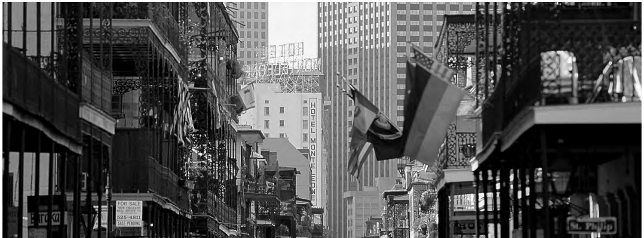
New Orleans City Council