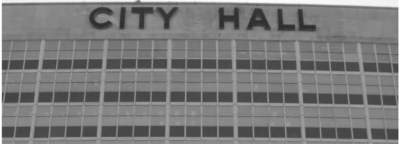
New Orleans City Council