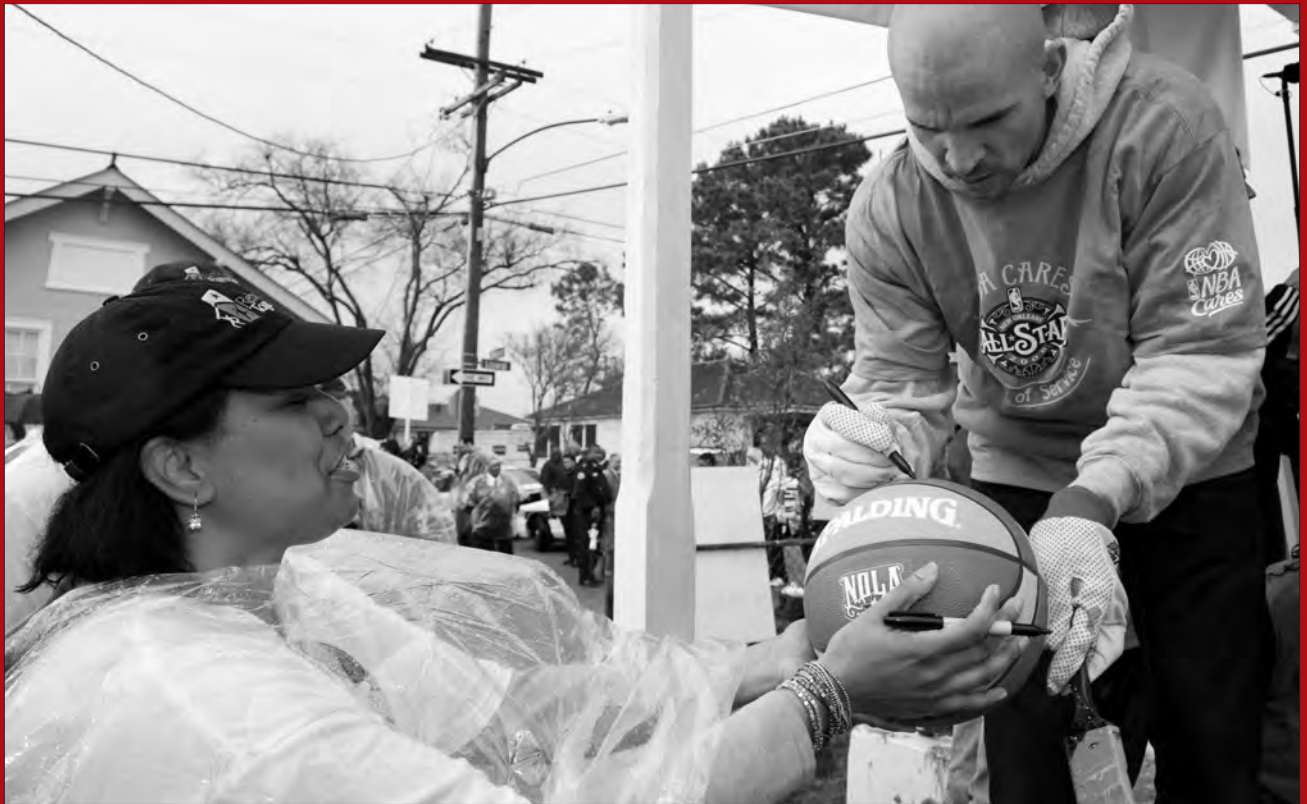
George Long Photography