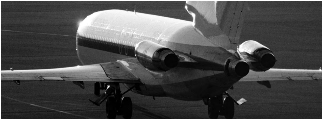
New Orleans City Council