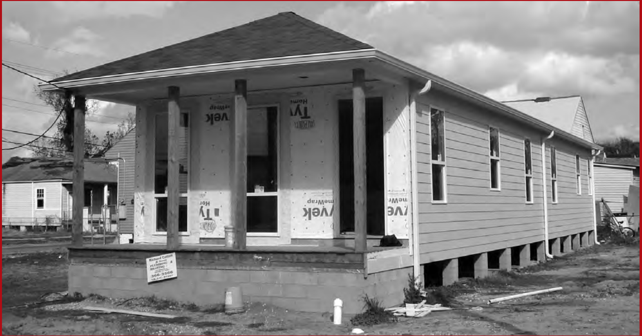
Jericho Road Episcopal Housing Initiative